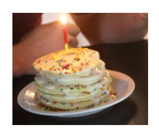
Men's Birthday Breakfast at Angie's Restaurant 7:15 AM